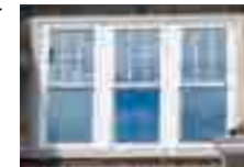
3-1/2" Flat casing picture frame in tan

Available in any of our exterior colors, our 3-1/2" flat casing picture and 2-1/4" brick molding are fully welded, factory applied, and come with an extruded J-channel pocket.