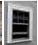
2-1/4" Brick Mold with Bullnose Sill