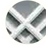
Deluxe top, flat internal

Patterns: Colonial, Prairie, Double Prairie, Diamond (flat internal only), Queen Anne, Valance, or specialty designs.