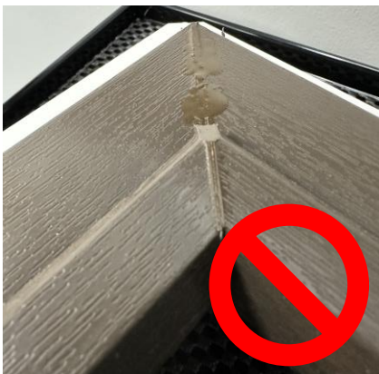
Excessive paint with runs

4.5 Check for streaks. Streaks are not permitted. If streaks appear, the paint film thickness is uneven.